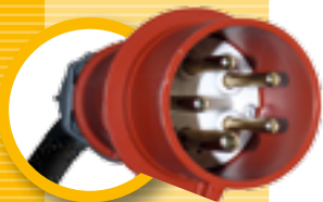
32 amperes version